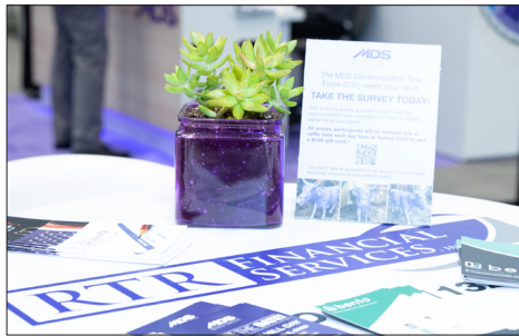
Table Top Signs