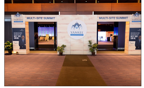
Multi-Site Entrance Unit